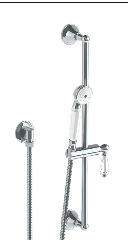
Available in all finishes shown on the Watermark Designs website