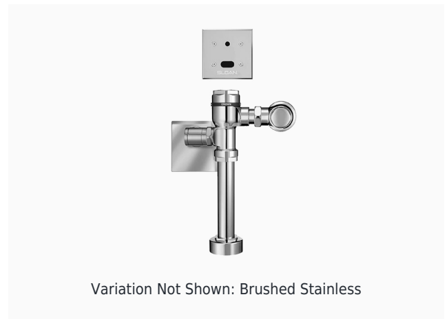
Variation Not Shown: Brushed Stainless