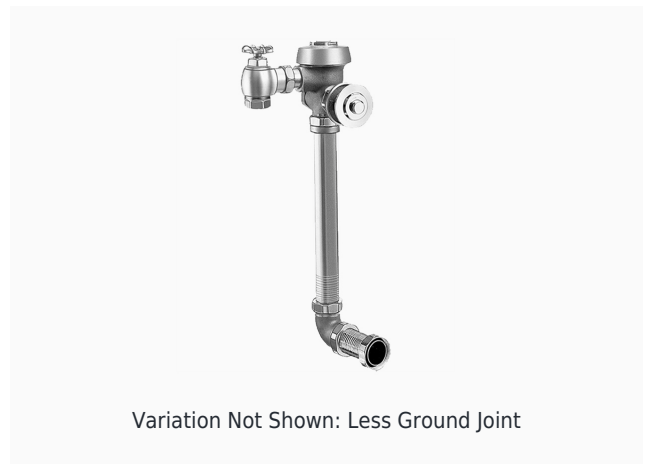
Variation Not Shown: Less Ground Joint