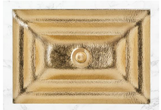
Shown in AG04A-BRS