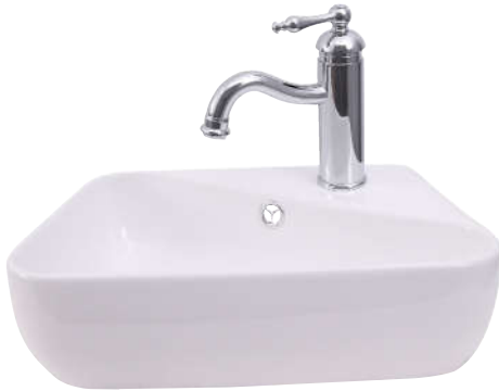
Faucet not included